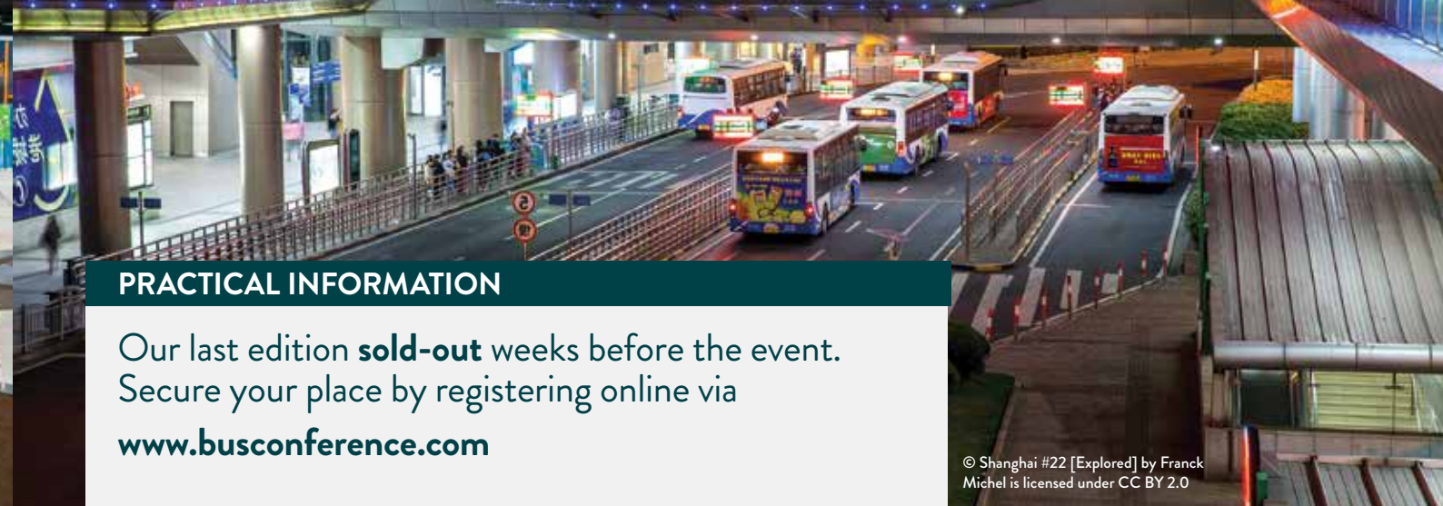
© Shanghai #22 [Explored] by Franck Michel is licensed under CC BY 2.0